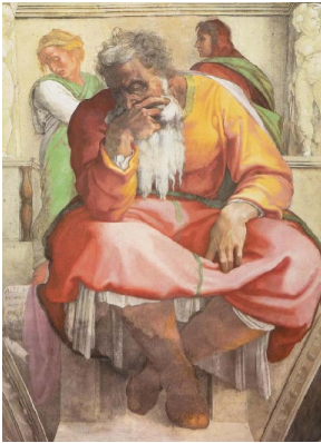
Jeremiah, as depicted by Michelangelo on the Sistine Chapel ceiling