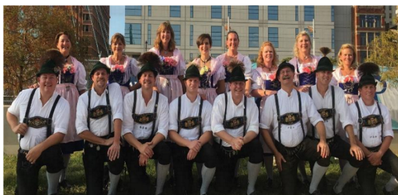
Featuring the Enzian German Dancers

Saturday, March 8 th , 2025 5:00 – 7:00 PM