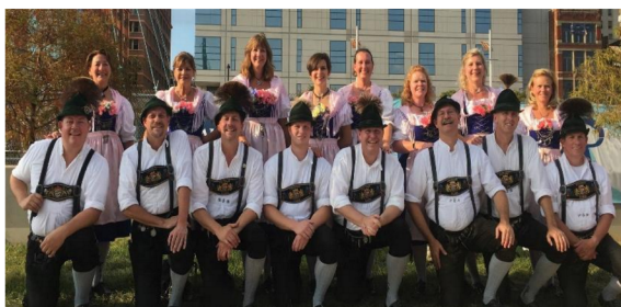
Featuring the Enzian German Dancers

Saturday, March 8 th , 2025 5:00 – 7:00 PM